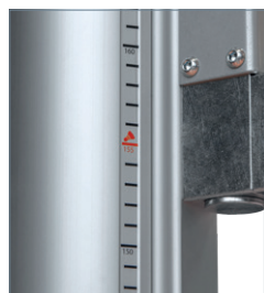
Net height indications