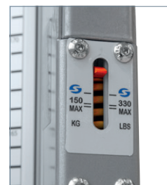
Net tension indicator